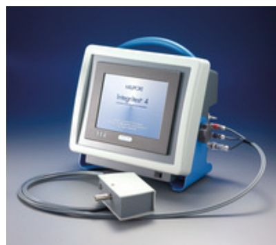
Figure 2: Millipore Integritest® 4

This facility will operate a GE PETtrace 8 cyclotron equipped with 5 targets: 2 Niobium for 18 F production, 1 11 C-CO 2 , 1 11 C-CH 4 and 1 15 O-target. The 4 first targets will be connected to 2 independent labs, a GMP production housing 4 hot cells and a R&D lab housing 3 hot cells. The target will be routed to the right destination using a specially designed Activity Delivery System. A specially designed ventilated HPLC cabinet, integrated within the row of hot cells will house 2 GE